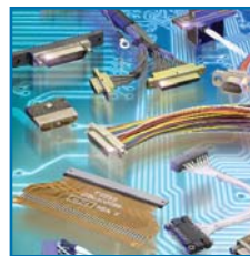
Microdot Connectors and Cables