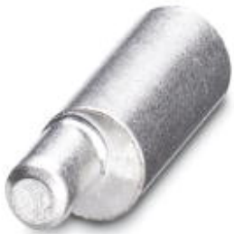
Cable lug for HEAVYCON-MODULAR; PE connection extension to 16 mm 2 , for crimping with crimp pliers

Please be informed that the data shown in this PDF Document is generated from our Online Catalog. Please find the complete data in the user's documentation. Our General Terms of Use for Downloads are valid ( http://phoenixcontact.com/download )