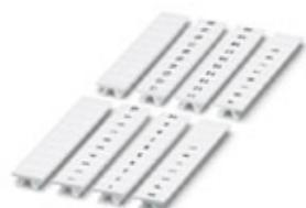
Zack marker strip, 10-section, vertically labeled with the consecutive numbers: 11 ... 20, white, width: 5 mm

Please be informed that the data shown in this PDF Document is generated from our Online Catalog. Please find the complete data in the user's documentation. Our General Terms of Use for Downloads are valid ( http://phoenixcontact.com/download )