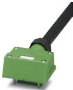
Sensor/actuator connector hood, with a master cable, marking label, for an SAC box with eight double-occupied slots

Please be informed that the data shown in this PDF Document is generated from our Online Catalog. Please find the complete data in the user's documentation. Our General Terms of Use for Downloads are valid ( http://phoenixcontact.com/download )