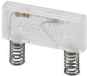
Light indicator, color: transparent

Please be informed that the data shown in this PDF Document is generated from our Online Catalog. Please find the complete data in the user's documentation. Our General Terms of Use for Downloads are valid ( http://phoenixcontact.com/download )