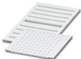
Zack marker sheet flat, 50-section, horizontally labeled with the consecutive numbers: 1 ... 5, 10 identically labeled strips per flat ZACK marker sheet, white

Please be informed that the data shown in this PDF Document is generated from our Online Catalog. Please find the complete data in the user's documentation. Our General Terms of Use for Downloads are valid ( http://phoenixcontact.com/download )