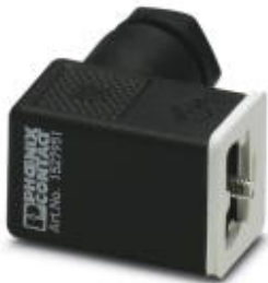
Valve connector, 3-pos., type C, unconnected, screw connection, cable screw connection Pg7

Please be informed that the data shown in this PDF Document is generated from our Online Catalog. Please find the complete data in the user's documentation. Our General Terms of Use for Downloads are valid ( http://phoenixcontact.com/download )