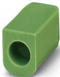
Keying cap, for forming sections, plugs onto header pin, green insulating material

Please be informed that the data shown in this PDF Document is generated from our Online Catalog. Please find the complete data in the user's documentation. Our General Terms of Use for Downloads are valid ( http://phoenixcontact.com/download )