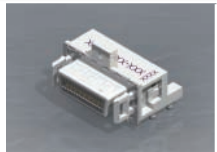
Lanyard latch with top mounting, rear arms U65-H04-40D0-T