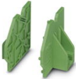
Pair of flanges, can be snapped onto a row of single terminal blocks

Please be informed that the data shown in this PDF Document is generated from our Online Catalog. Please find the complete data in the user's documentation. Our General Terms of Use for Downloads are valid ( http://phoenixcontact.com/download )