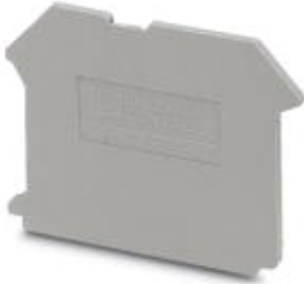
End cover, Length: 50 mm, Width: 2 mm, Height: 36 mm, Color: gray

Please be informed that the data shown in this PDF Document is generated from our Online Catalog. Please find the complete data in the user's documentation. Our General Terms of Use for Downloads are valid ( http://phoenixcontact.com/download )