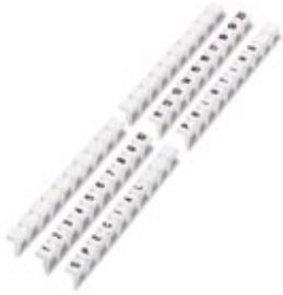
BNB Zack marker strip, 10-section, divisible, horizontally labeled with the consecutive numbers: 11 ... 20, white

Please be informed that the data shown in this PDF Document is generated from our Online Catalog. Please find the complete data in the user's documentation. Our General Terms of Use for Downloads are valid ( http://phoenixcontact.com/download )