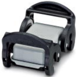
HEAVYCON protective cover, type B10, for sleeve housing without double locking latch, with retaining cord, IP54

Please be informed that the data shown in this PDF Document is generated from our Online Catalog. Please find the complete data in the user's documentation. Our General Terms of Use for Downloads are valid ( http://phoenixcontact.com/download )