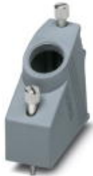
Sleeve housing, plastic, with metric cable outlet, locking screws with knurled head, type: VC2, cable screw connection: M25

Please be informed that the data shown in this PDF Document is generated from our Online Catalog. Please find the complete data in the user's documentation. Our General Terms of Use for Downloads are valid ( http://phoenixcontact.com/download )