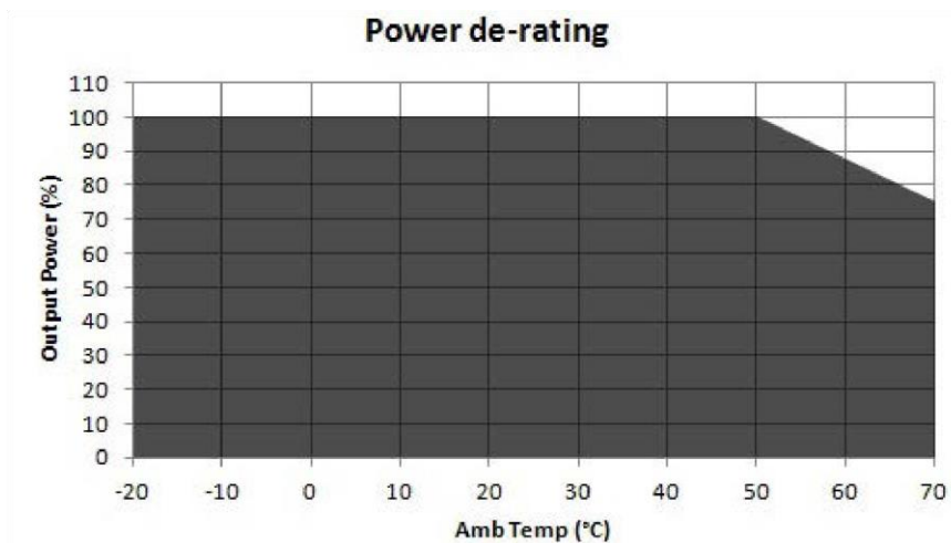
Figure 1. Derating Curve

De-rate linearly from 100% at 50°C to 75% at 70°C