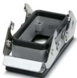
HEAVYCON B10; with double locking latch made of sheet steel (not divided); height 27 mm, with flat gasket

Please be informed that the data shown in this PDF Document is generated from our Online Catalog. Please find the complete data in the user's documentation. Our General Terms of Use for Downloads are valid ( http://phoenixcontact.com/download )