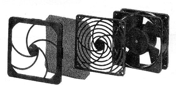
Retainer Media Guard

Snap-in Retainer makes cleaning or replacing media simple. No tools required.