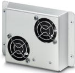
Fan module for Remote Field Controllers RFC 430 ETH-IB / RFC 450 ETH-IB

Please be informed that the data shown in this PDF Document is generated from our Online Catalog. Please find the complete data in the user's documentation. Our General Terms of Use for Downloads are valid ( http://phoenixcontact.com/download )