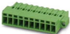
The figure shows an 10-position version

PCB connector, nominal current: 12 A, rated voltage (III/2): 320 V, number of positions: 6, pitch: 5.08 mm, connection method: Crimp connection, color: green