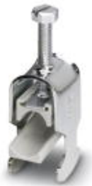
Cable clamp, for DIN rails

Please be informed that the data shown in this PDF Document is generated from our Online Catalog. Please find the complete data in the user's documentation. Our General Terms of Use for Downloads are valid ( http://phoenixcontact.com/download )