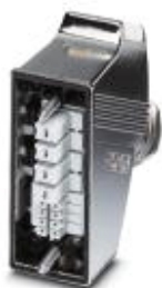
Sleeve housing, made of metal, with EMC coating, in accordance with drawing

Please be informed that the data shown in this PDF Document is generated from our Online Catalog. Please find the complete data in the user's documentation. Our General Terms of Use for Downloads are valid ( http://phoenixcontact.com/download )