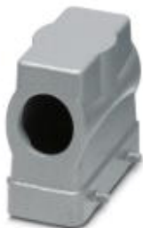
HEAVYCON B16 sleeve housing, for double locking latch, height: 76 mm, with 1 x M25 thread, lateral cable outlet

Please be informed that the data shown in this PDF Document is generated from our Online Catalog. Please find the complete data in the user's documentation. Our General Terms of Use for Downloads are valid ( http://phoenixcontact.com/download )