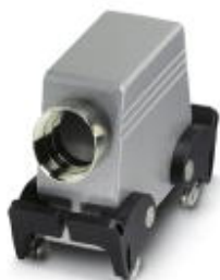
HEAVYCON sleeve housing B16, with double locking latch, height 76 mm, with support 1x M25, lateral conductor exit

Please be informed that the data shown in this PDF Document is generated from our Online Catalog. Please find the complete data in the user's documentation. Our General Terms of Use for Downloads are valid ( http://phoenixcontact.com/download )