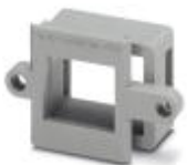
RJ45 panel mounting frame, 1x, IP20, for modular socket inserts (Keystone), without mounting screws

Panel mounting frames - VS-08-A-RJ45/MOD-1-IP20 - 1689433