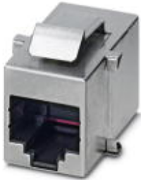
RJ45 socket insert, modular (Keystone), CAT5e, 8-pos., shielded, socket on socket

Please be informed that the data shown in this PDF Document is generated from our Online Catalog. Please find the complete data in the user's documentation. Our General Terms of Use for Downloads are valid ( http://phoenixcontact.com/download )