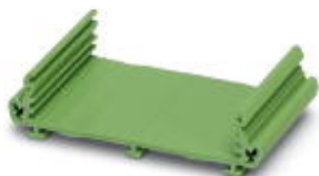
The figure shows the variant UM 45-Profil CM

Panel mounting base, length: 1000 mm, open, Lower part, Cross connection: without bus connector, color: green, width: 1000 mm, number of positions cross connector: not relevant, Note: required profile length = PCB length - 3.6 mm