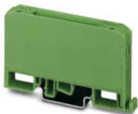
Electronic housing, with universal foot, without screw connection terminal blocks and cover

Please be informed that the data shown in this PDF Document is generated from our Online Catalog. Please find the complete data in the user's documentation. Our General Terms of Use for Downloads are valid ( http://phoenixcontact.com/download )