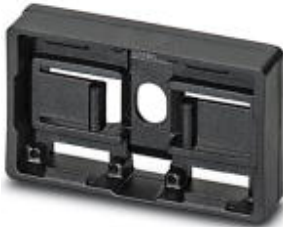
Marker carriers, black, unlabeled, Mounting type: Screws, rivets, Lettering field: 49 x 15 mm

Please be informed that the data shown in this PDF Document is generated from our Online Catalog. Please find the complete data in the user's documentation. Our General Terms of Use for Downloads are valid ( http://phoenixcontact.com/download )