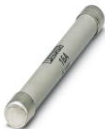
Fuse, 10.3 mm x 85 mm, up to 1500 V DC, gPV characteristic

Please be informed that the data shown in this PDF Document is generated from our Online Catalog. Please find the complete data in the user's documentation. Our General Terms of Use for Downloads are valid ( http://phoenixcontact.com/download )