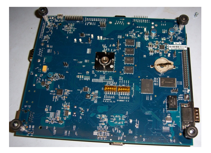
Figure 2. AM437x GP EVM Bottom View