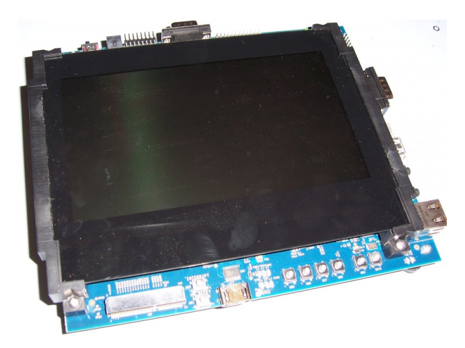
Figure 1. AM437x GP EVM Top View

The system view of the AM437x GP EVM consists of the main board and the camera board. See Figure 1 and Figure 2 of the EVM.