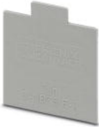
End cover, Length: 28 mm, Width: 1 mm, Color: gray

Please be informed that the data shown in this PDF Document is generated from our Online Catalog. Please find the complete data in the user's documentation. Our General Terms of Use for Downloads are valid ( http://phoenixcontact.com/download )