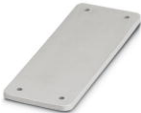
HEAVYCON cover plate, for wall cutouts of type B6, 3.5 mm thick, gray

Please be informed that the data shown in this PDF Document is generated from our Online Catalog. Please find the complete data in the user's documentation. Our General Terms of Use for Downloads are valid ( http://phoenixcontact.com/download )