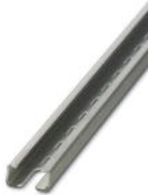
DIN rails, for accommodating cable clamps

Please be informed that the data shown in this PDF Document is generated from our Online Catalog. Please find the complete data in the user's documentation. Our General Terms of Use for Downloads are valid ( http://phoenixcontact.com/download )