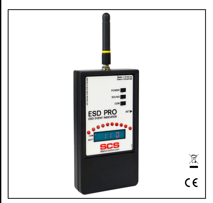
Figure 1. CTM082 ESD Pro ESD Event Indicator.