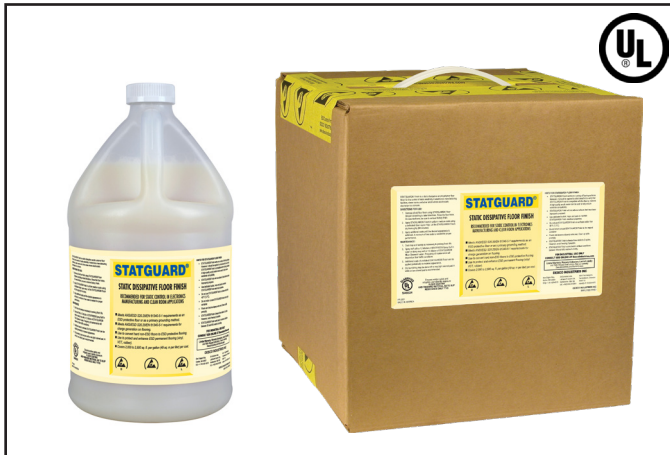
Figure 1. Statguard® Static Dissipative Floor Finish 1 gallon bottle & 5 gallon bag-in-box