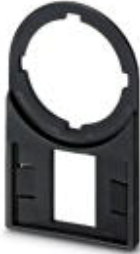
Marker carriers, black, unlabeled, Mounting type: Screws, rivets, Diameter: 22 mm, Lettering field: 27 x 18 mm

Please be informed that the data shown in this PDF Document is generated from our Online Catalog. Please find the complete data in the user's documentation. Our General Terms of Use for Downloads are valid ( http://phoenixcontact.com/download )