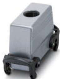
HEAVYCON B24 sleeve housing, with double locking latch, height: 76 mm, with 1 x M40 thread, lateral cable outlet

Please be informed that the data shown in this PDF Document is generated from our Online Catalog. Please find the complete data in the user's documentation. Our General Terms of Use for Downloads are valid ( http://phoenixcontact.com/download )