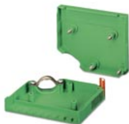
Cable housing, Pitch: 0 mm, Number of positions: 9, Dimension a: 70.38 mm, Color: green

Please be informed that the data shown in this PDF Document is generated from our Online Catalog. Please find the complete data in the user's documentation. Our General Terms of Use for Downloads are valid ( http://phoenixcontact.com/download )