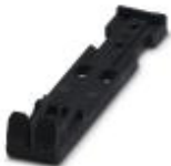
Strain relief, Number of positions: 2, Color: black