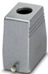
HEAVYCON sleeve housing B10, for single locking latch, height 72 mm, without support 1x M25, straight conductor exit

Please be informed that the data shown in this PDF Document is generated from our Online Catalog. Please find the complete data in the user's documentation. Our General Terms of Use for Downloads are valid ( http://phoenixcontact.com/download )