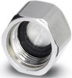
M12 metal sealing cap for unoccupied M12 plugs of the sensor/actuator cable, flush-type plugs and I/O devices in the field

Please be informed that the data shown in this PDF Document is generated from our Online Catalog. Please find the complete data in the user's documentation. Our General Terms of Use for Downloads are valid ( http://phoenixcontact.com/download )