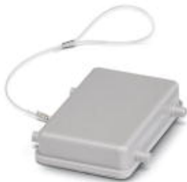
HEAVYCON protective cover, type D50, for supporting base element with single locking latch, with retaining cord, IP54, PA

Please be informed that the data shown in this PDF Document is generated from our Online Catalog. Please find the complete data in the user's documentation. Our General Terms of Use for Downloads are valid ( http://phoenixcontact.com/download )