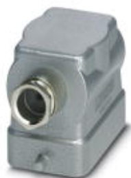
HEAVYCON B6 sleeve housing, for single locking latch, height: 56 mm, with 1 x Pg13.5 screw connection, lateral cable outlet

Please be informed that the data shown in this PDF Document is generated from our Online Catalog. Please find the complete data in the user's documentation. Our General Terms of Use for Downloads are valid ( http://phoenixcontact.com/download )