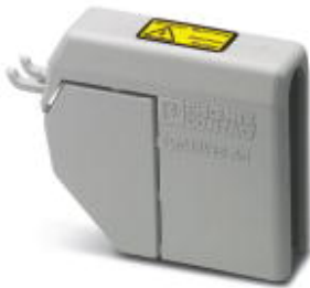
Covering hood, Width: 43 mm, Height: 71 mm, Color: gray

Please be informed that the data shown in this PDF Document is generated from our Online Catalog. Please find the complete data in the user's documentation. Our General Terms of Use for Downloads are valid ( http://phoenixcontact.com/download )