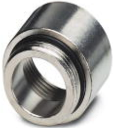
NPT adapter, IP68, up to 5 bar, incl. O-ring seal, M32 to 1"

Please be informed that the data shown in this PDF Document is generated from our Online Catalog. Please find the complete data in the user's documentation. Our General Terms of Use for Downloads are valid ( http://phoenixcontact.com/download )