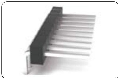
Right Angle / Breakaway Header**