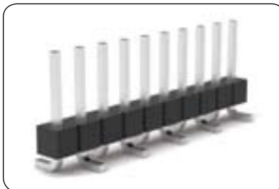
Surface Mount / Breakaway Header**