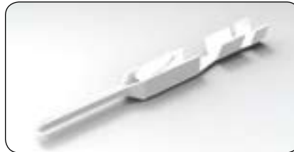
Crimp Snap-In Pin Contact