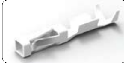
Crimp Snap-In Short Point Contact