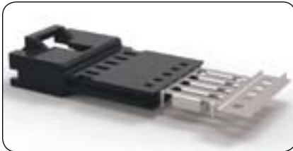
IDC AMPMODU MTE