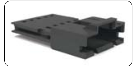
AMPMODU MTE Housing