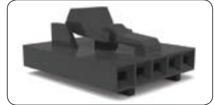
AMPMODU MTE Housing