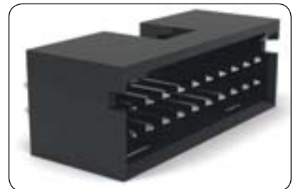
Vertical / Shrouded Header