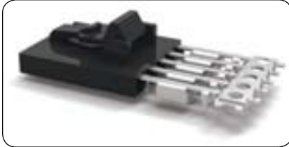
IDC AMPMODU MTE