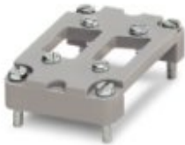
D-SUB adapter plate, for two D-SUB connectors, no. of positions 9, housing series HC-B 6...

Please be informed that the data shown in this PDF Document is generated from our Online Catalog. Please find the complete data in the user's documentation. Our General Terms of Use for Downloads are valid ( http://phoenixcontact.com/download )