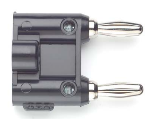
Model MDP, 4892, 4898 Stackable Double Banana Plug with Cable Guide