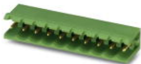
The figure shows a 10-pos. version of the product in green

PCB headers, nominal current: 12 A, rated voltage (III/2): 320 V, number of positions: 5, pitch: 5.08 mm, color: green, contact surface: Gold, mounting: Wave soldering