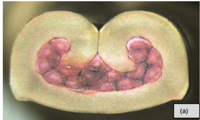
Cross Sections Showing Minimum (a) and Maximum (b) Area Index per Terminal Specification—a Variation of \pm 3.5\%

Therefore, varying the CW by 2% would result in a CH variation of 2%, or 0.0014 in. At a CH tolerance of \pm 0.002 in, 35% of the total CH tolerance would be used by a 2% variation in CW. Thus, the importance of crimp width control is obvious when tooling is changed during a production run.