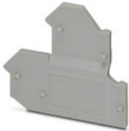
End cover, Length: 50 mm, Width: 2.5 mm, Height: 53.5 mm, Color: gray

Please be informed that the data shown in this PDF Document is generated from our Online Catalog. Please find the complete data in the user's documentation. Our General Terms of Use for Downloads are valid ( http://phoenixcontact.com/download )